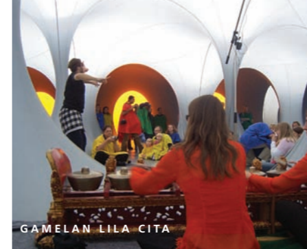
GAMELAN LILA CITA

Every day from Monday to Friday there will be workshops in colour, light and music given by the Colourscape artists, musicians and performers. These workshops will cover a range of topics exploring the scientific nature of colour and light as well as art and music. If you would like to bring a group to participate in the workshop week please ring the festival telephone number to check availability. Workshops cost £3 per student for a one-hour session or £5.50 for a full morning or afternoon.