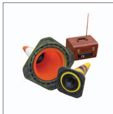
Lay-by Lullaby installation, exhibited at the Agency Gallery, London.